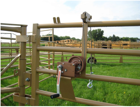
Winches for letting down #2 & #3 panels & optional interior bow gate