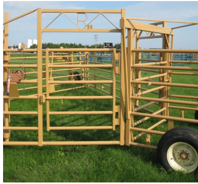
Tall, 4 ft. wide walk-through gates on each of the #1 panels

Available at our Freeman, SD location. For inquiries outside of the Freeman, SD area stop at your local FOR-MOST dealer, call FOR-MOST at 1-800-845-6103 for the nearest dealer or visit www.for-most.com