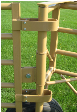
Sturdy double saddle and bolt hinge mechanism for operation on unlevel terrains. Exclusive bolt together design.

Available at our Freeman, SD location. For inquiries outside of the Freeman, SD area stop at your local FOR-MOST dealer, call FOR-MOST at 1-800-845-6103 for the nearest dealer or visit www.for-most.com