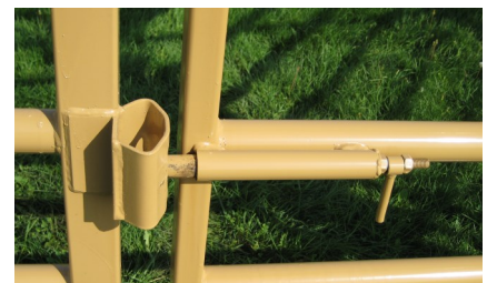
Spring latches on the alley gate, 4 ft. walk through gates and the optional alley bow gate