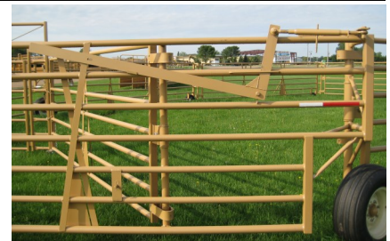
Easy to use long levers for changing the direction of the rear tire for unfolding/folding